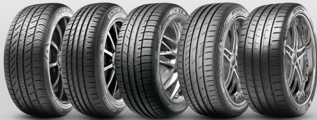
KU22 HS51 KU39 PS71 PS91

Kumho Tyre Australia Pty Ltd ("Kumho Tyre Australia") is pleased to offer you this Road Hazard Warranty ("Warranty").